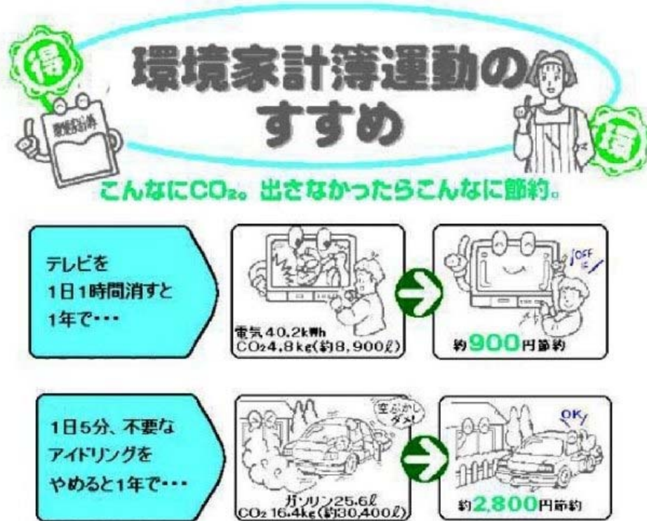
Figure 2. Environmentally friendly life style “Tips” in the environmental housekeeping book

The Ministry of the Environment presented their “Environmental Housekeeping Book” in 1997 (see Figure 2). This has “a conversion table” from electricity, kerosene, or other energy consumption to carbon dioxide emission, and also “tips” for environmentally friendly life styles. Many local governments now also encourage households to maintain an ‘Environmental Housekeeping Book.’